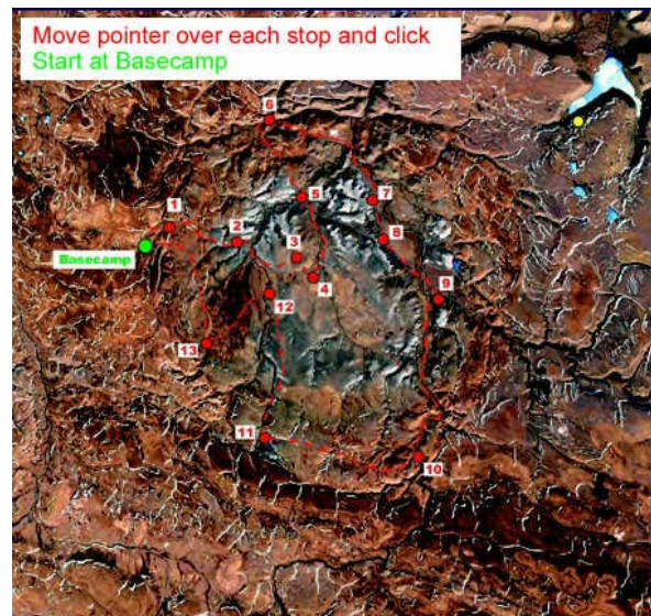
Figure 2. Map of the Haughton virtual tour.