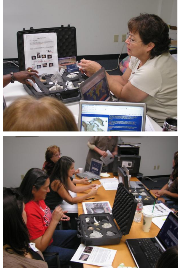
Fig. 2: During the Impact Craters! workshop, teachers learn about impact rocks by using the impact rock kits in combination with the virtual tours at the Explorer's Guide to Impact Craters.

This work is supported by NASA Grant NNX06AB65G.