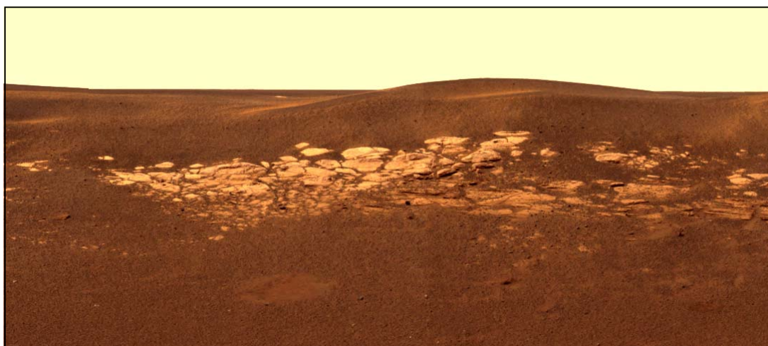
NASA scored a hole-in-one, landing the Opportunity rover in this impact crater at Meridiani Planum. This serene photo shows a Martian outcrop of layered bedding which will be key to exploring the water history on Mars.